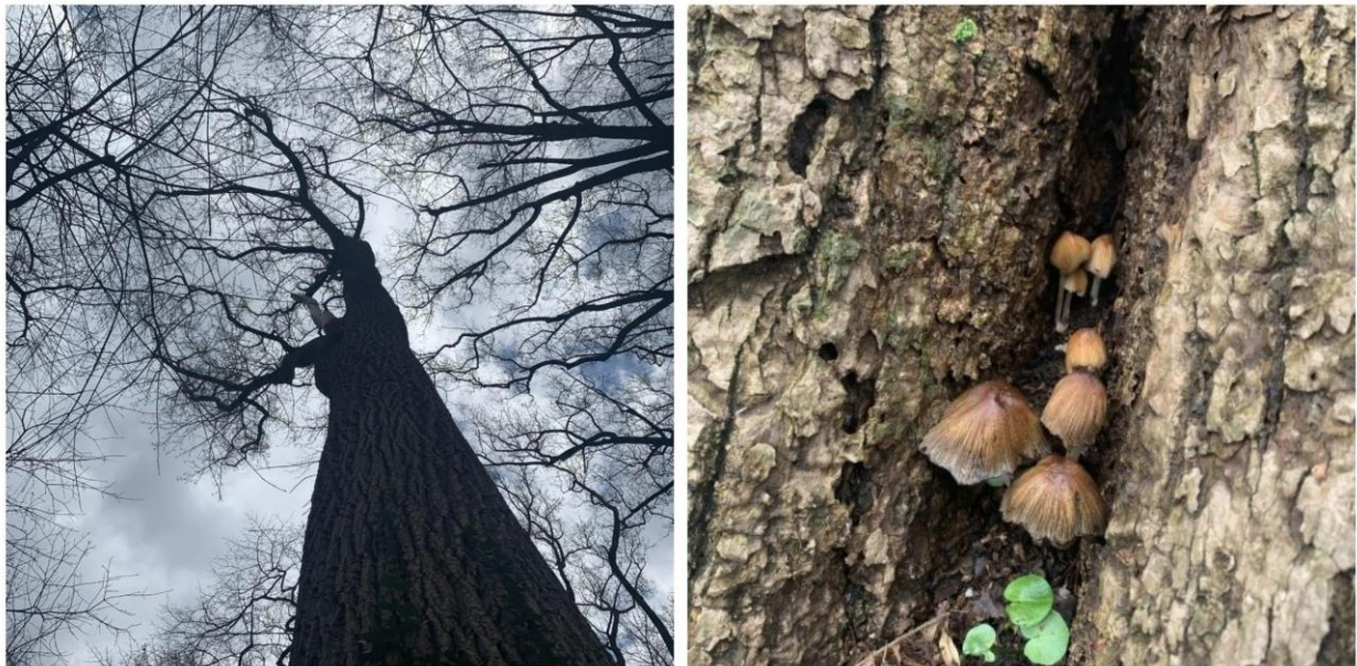
FIGURE 1: This is an example of how the sites were used and recorded. The canopy was photographed in order to determine the percent of canopy density. An image was also taken of the macrofungi.

base of different species of trees. Within a 10 foot radius of the tree, the number of macrofungi was counted. Photographs were taken of the canopy from the base of the tree and a photograph was taken of the macrofungi. The canopy density was determined in a percentage value of canopy covering the sky when looking at the photograph taken when looking up from the base of the tree seen in Figure 1. After the sites were located, a statistical analysis was conducted found in Figure 2. A Pearson Product-Moment Correlation analysis was conducted to measure the linear correlation between two sets of continuous variables.